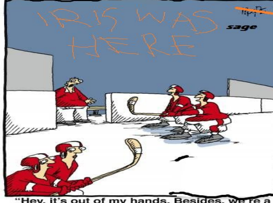
"Hey, it's out of my hands. Besides, we re a team! And if in the interest of saving a few bucks we're asked to share hockey sticks, then so VIET

Anatoli Tarasov" September 9th